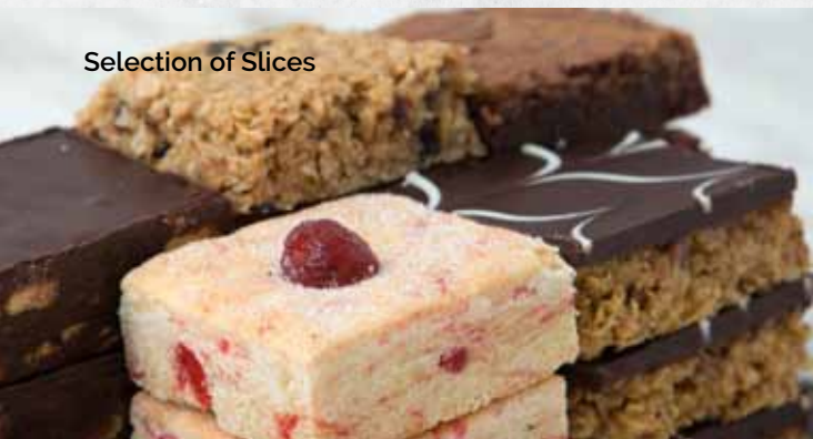
Selection of Slices