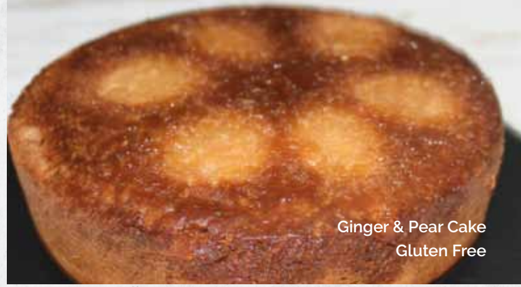
Ginger & Pear Cake Gluten Free