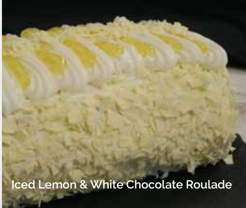
Iced Lemon & White Chocolate Roulade