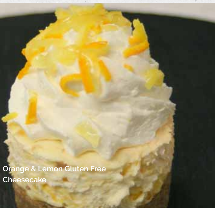
Orange & Lemon Gluten Free Cheesecake