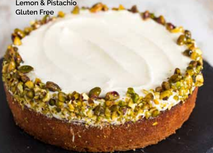
Lemon & Pistachio Gluten Free