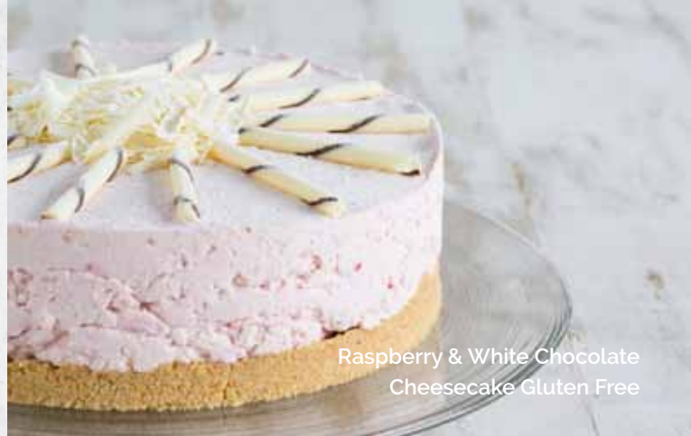
Raspberry & White Chocolate Cheesecake Gluten Free