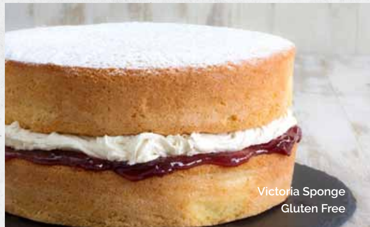
Victoria Sponge Gluten Free