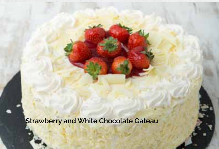
Strawberry and White Chocolate Gateau