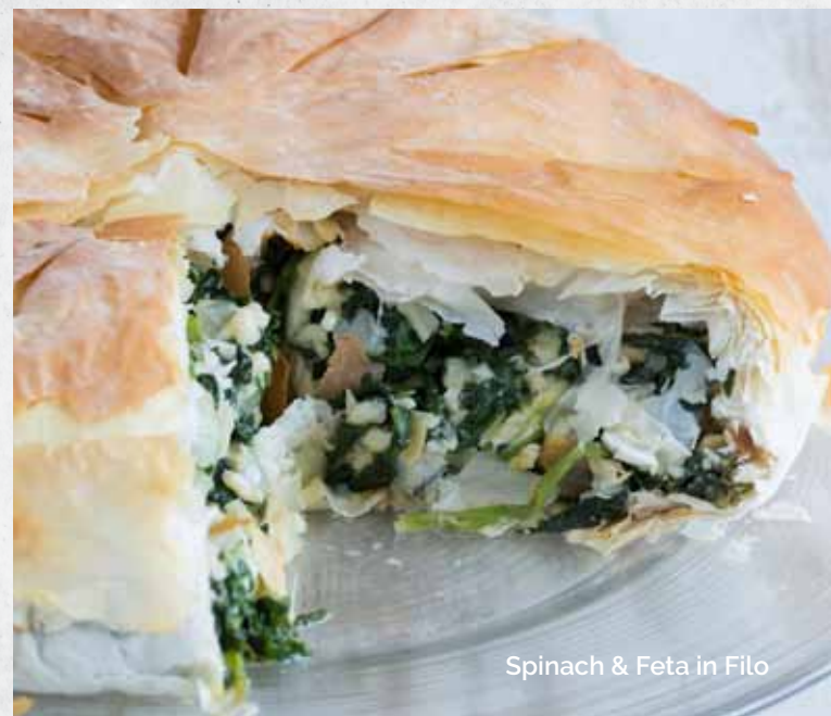
Spinach & Feta in Filo