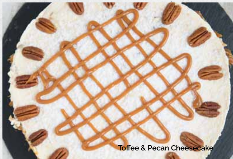
Toffee & Pecan Cheesecake