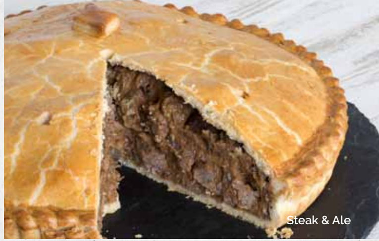
Steak & Ale