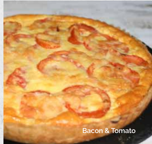
Bacon & Tomato