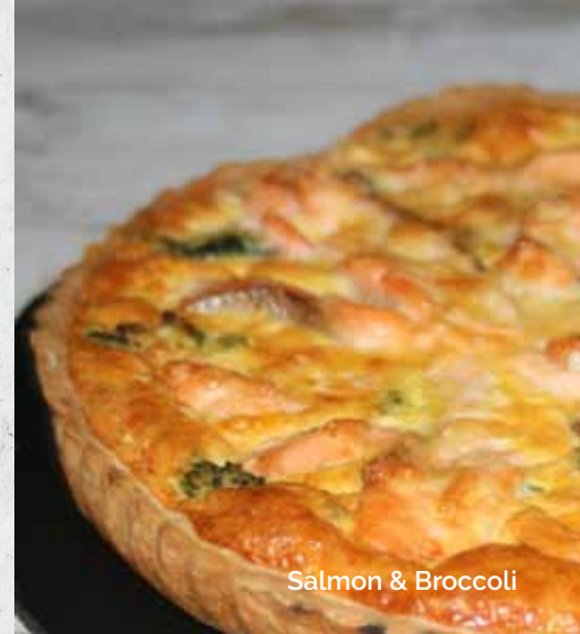
Salmon & Broccoli