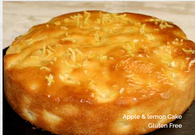
Apple & lemon Cake Gluten Free