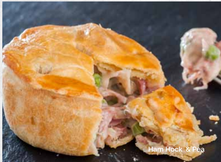
Ham Hock & Pea