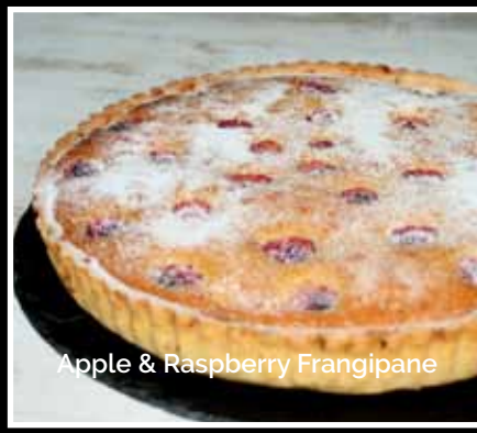
Apple & Raspberry Frangipane