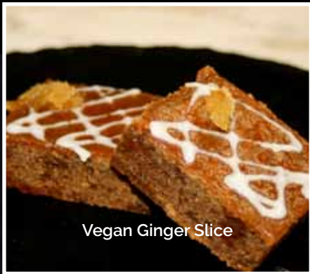
Vegan Ginger Slice