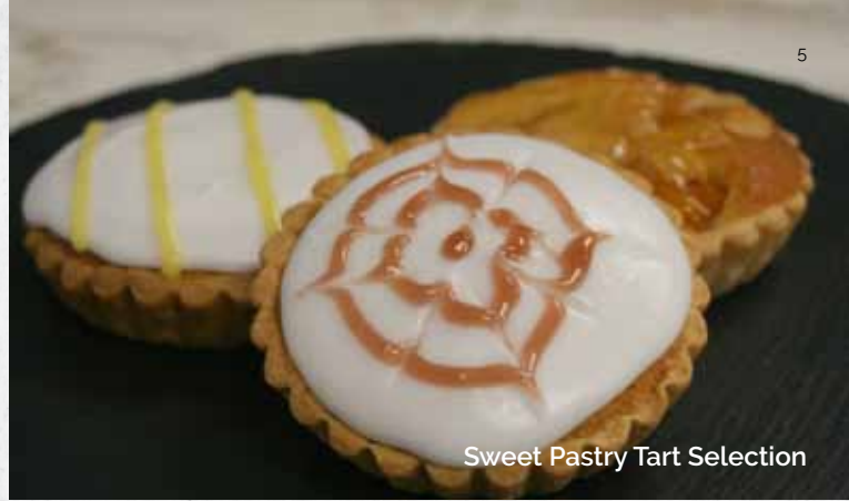
Sweet Pastry Tart Selection