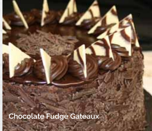
Chocolate Fudge Gateaux